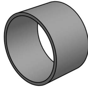
Figure 4.4 Compression Sleeve

The third and final part of the mechanical joint, the compression sleeve imparts radial pressure onto the plastic adapter, forcing material into the steel nipple indentation system (figure 4.4). The compression sleeve is pressed onto the bell of the plastic adapter, displacing material radially into the indentations. As there is significant interfacial pressure between the inside diameter of the compression sleeve and the outside diameter of the plastic adapter, the compression sleeve is designed and manufactured such that it will resist creep, and impart even pressure circumferentially. This even circumferential pressure ensures that the indentations on the steel nipple are filled evenly with material from the plastic adapter, resulting a strong, bubble-tight joint.