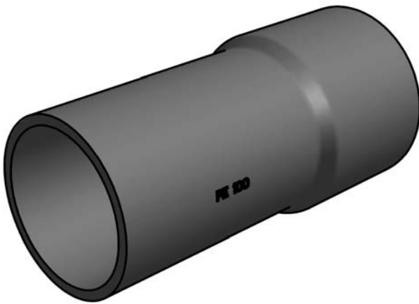
Figure 4.3 Plastic Adapter

A precision machined component, the plastic adapter connects to the polyethylene pipe system, and forms the mechanical joint along with the steel nipple and compression sleeve (figure 4.3). The adapter features a bell/socket feature to accept the steel nipple without deforming the polyethylene, eliminating long-term embrittlement which reduces the life of the fitting. The compression sleeve fits, with significant interference, over the bell locking the joint into place. The free-end of the plastic adapter is fusion-ready, meeting the dimensional specifications listed in ASTM D2513.