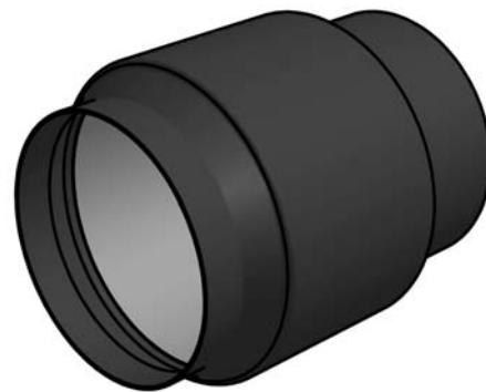
Figure 4.5 Corrosion Protection Sleeve

Covering the compression sleeve, a the portion of the steel nipple adjacent to the plastic adapter bell, as well as a portion of the free-end of the plastic adapter, corrosion protection seals the ferrous materials from the elements (figure 4.5). It is factory-applied in a controlled and monitored environment, ensuring that the mechanical joint is free of any sources corrosion.