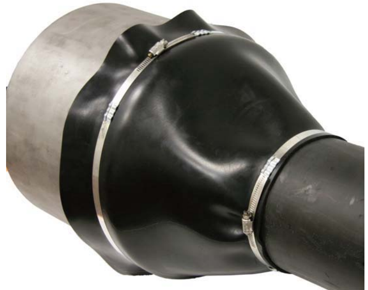
Above: Endseal between Casing (grey) and Carrier (black) Below: Required ordering dimensions.

Installation temperature: 0°F to 120°F (-18°C to 49°C) Continuous service: -25°F to 180°F (-32°C to 82°C)