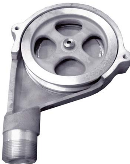
Left: Sparrowhawk Gauge Head with cover removed, showing the close pulley-housing clearance.